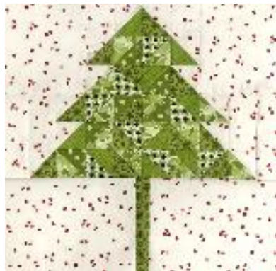
Half Square Triangle Projects