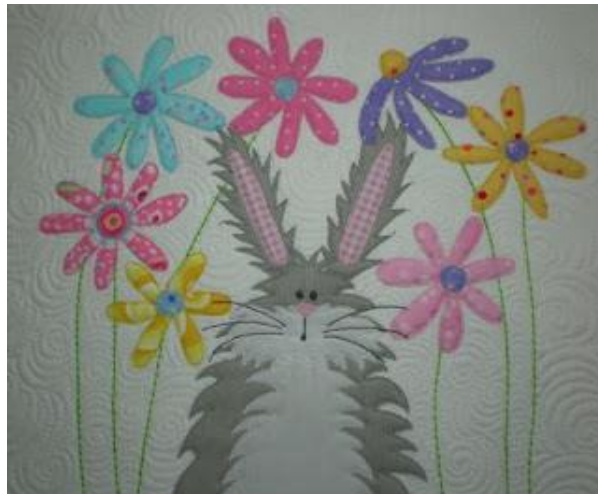
Honey Bunny Mini Quilt