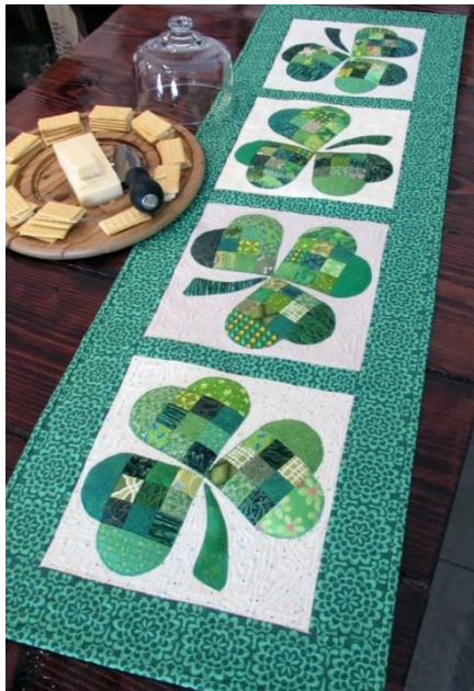
Shamrock Table Runner