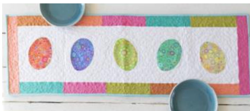
Easter Egg Table Runner