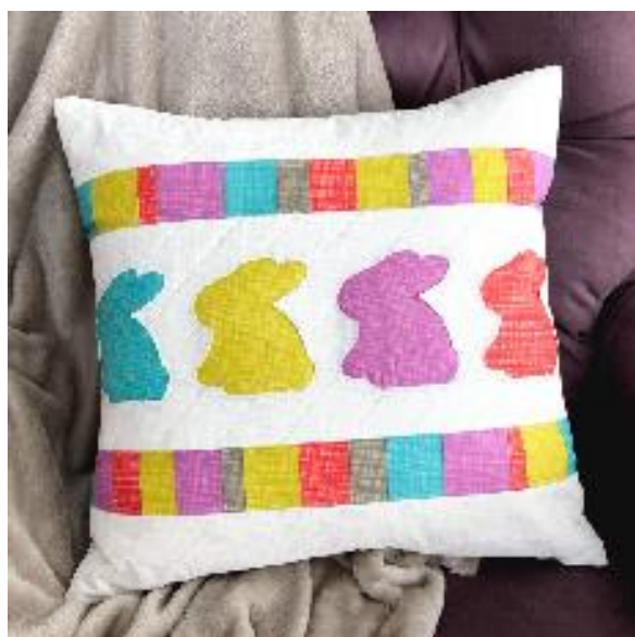
Bunny Hop Pillow

Make sure you look at all the business cards below which are from our sponsors. We have had a few new sponsors join us over the past few months.