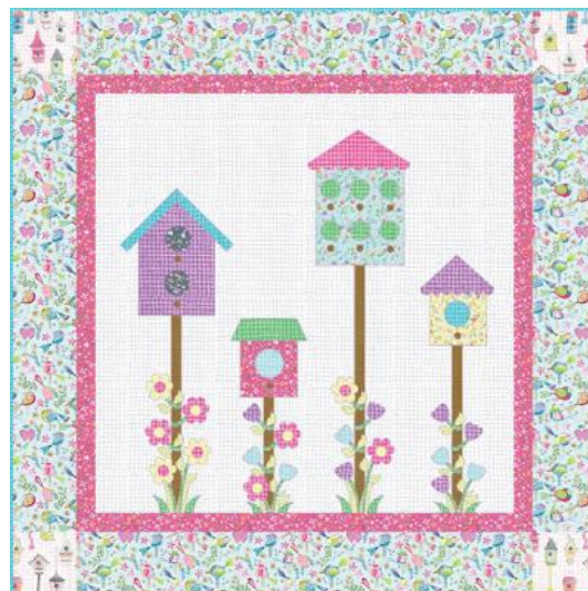
Tweet Me Quilt

I am looking forward to our next quilt show. I started attending the TVQG quilt shows long before I was a member. The show has never disappointed me. We are a talented crowd!