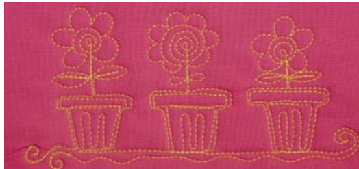
How to Free-motion Quilt the Lollipop Flower

Frankford United Church - 3rd Thursday of the month: March 16, April 20, May 18 & June 15