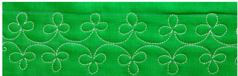
How to Free Motion Shamrocks