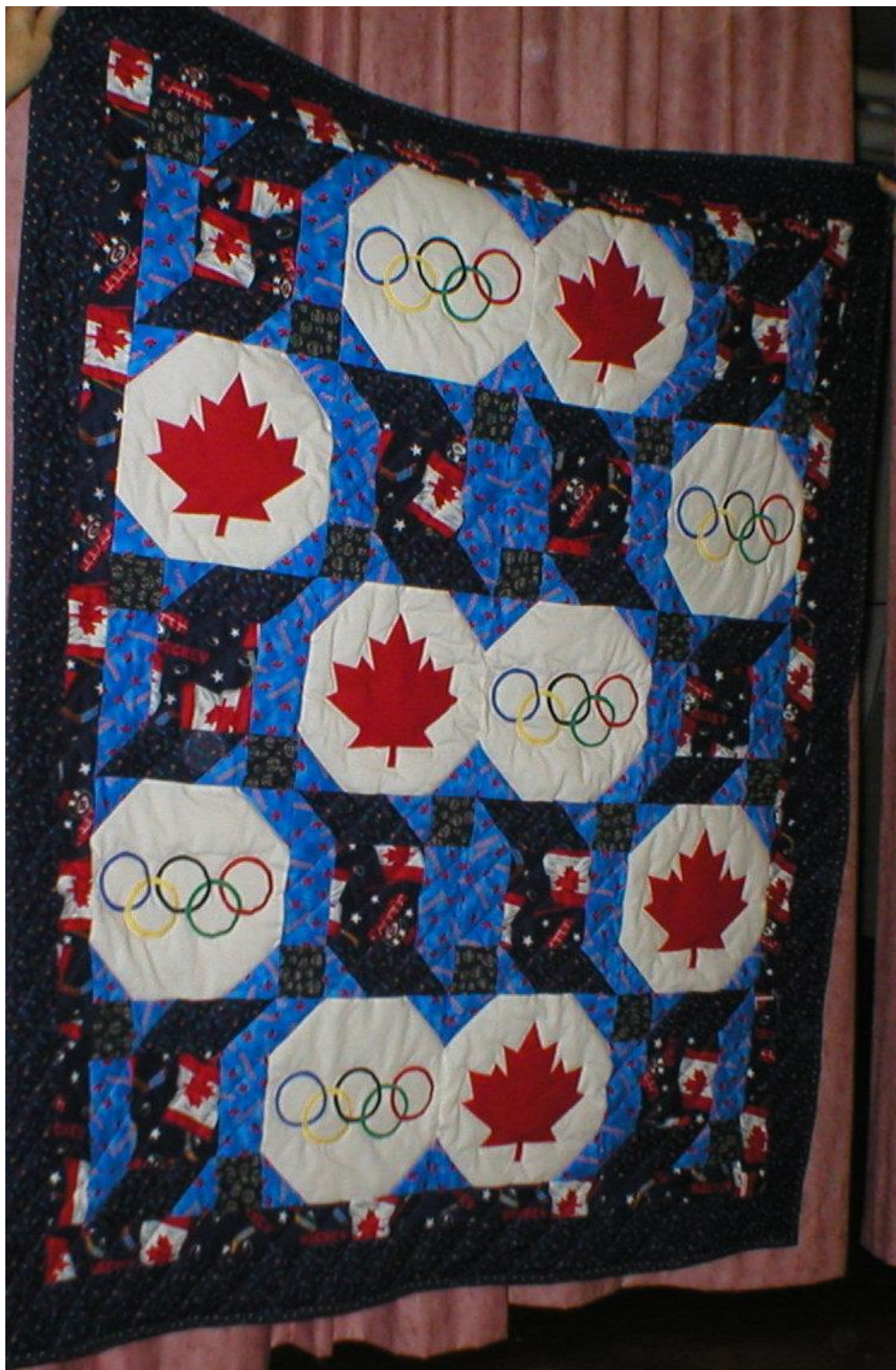
Jess' Olympic Quilt